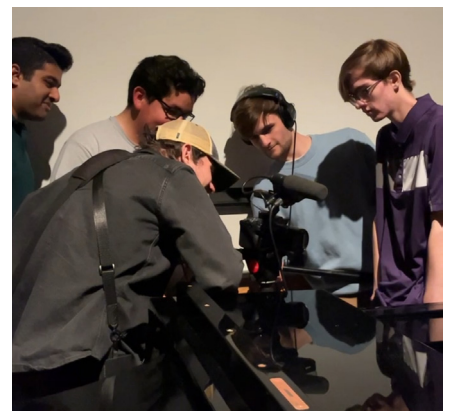
School of Digital Media students filming during the 24-hour film festival, an event organized by MCA