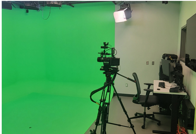
GREEN SCREEN ROOM