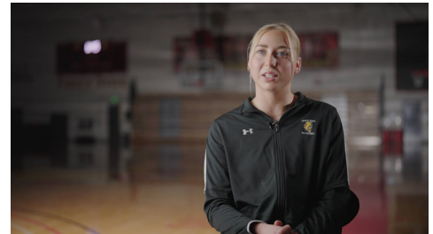
CHLOE IDONI A screenshot from the Ferris 140th Anniversary Documentary. A segment of the film focuses on the challenges and successes of student athletes.