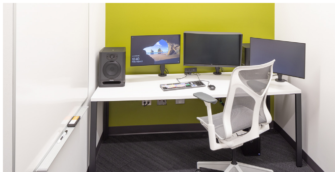
SENIOR EDITING BAYS