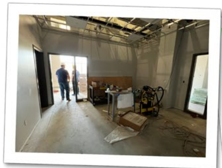
THE NEW MEDIA SUPPLY