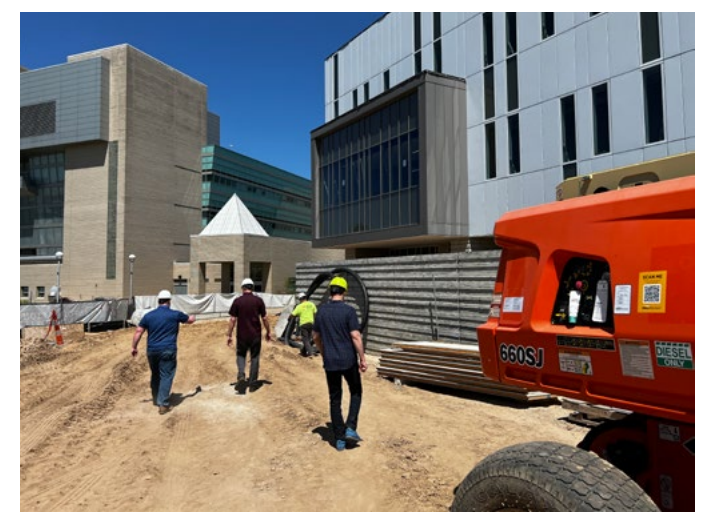
TDMP FACULTY TOUR MAY, 2023

Most exciting for me as part of this move, is that SDM faculty and staff will once again be situated right across the hall from our teaching spaces! This will allow a level of connectedness between students and faculty that we haven't enjoyed since the IRC renovation almost 20 years ago! Furniture selection was recently finalized for labs, classrooms, and offices, and new computers and monitors will be ordered soon – we have quotes in hand. The goal is to be in this new space, up and running, for the start of the Fall semester. Of course, there is much to do, and many moving parts, between now and then!