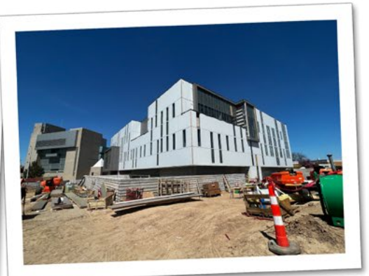
CVL NEXT TO FLITE LIBRARY