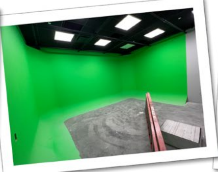
GREEN SCREEN STUDIO